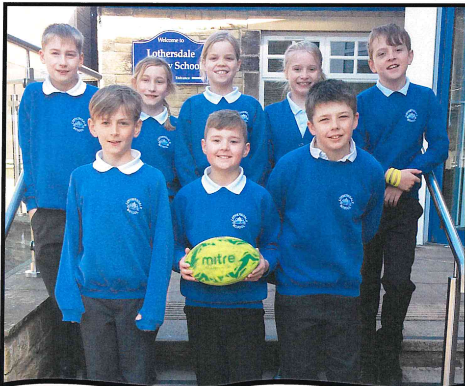
LOTHERSDALE PRIMARY SCHOOL Y5/6 TAG RUGBY TEAM SOUTH CRAVEN CLUSTER TAG RUGBY TOURNAMENT ~ WINNERS ~ 10 APRIL 2019

had five games in a row, so knew fitness would be a big factor.