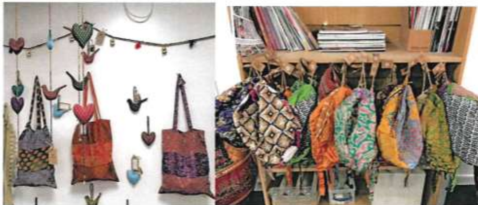
Bags and hangings made for Namaste in India from recycled silk saris