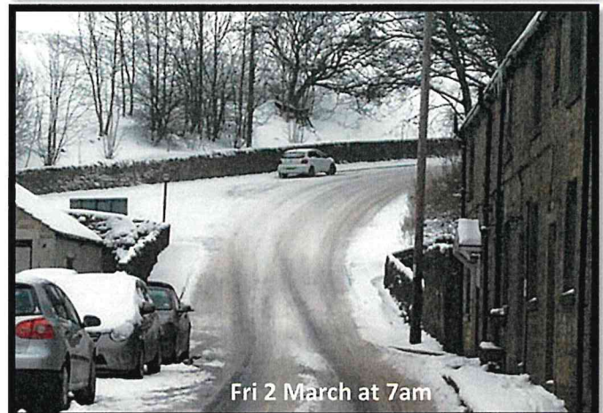
Fri 2 March at 7am