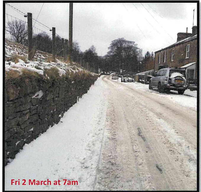
Fri 2 March at 7am

Hopefully the weather and road conditions will improve over the weekend and we will be back to normal on Monday!