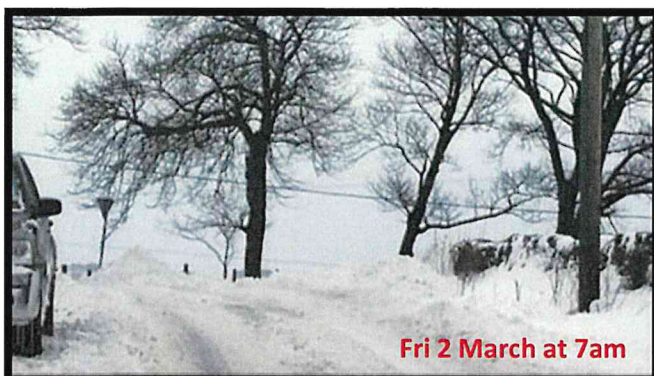
Fri 2 March at 7am