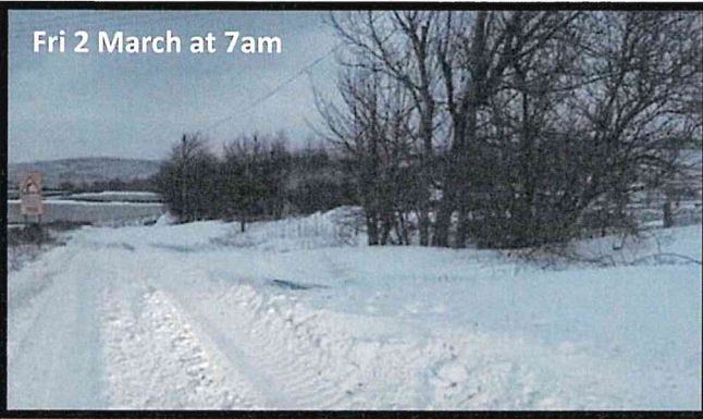
Fri 2 March at 7am