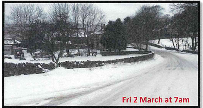
Fri 2 March at 7am

Throughout the week the roads into, through and out of Lothersdale have remained largely un-gritted since late Tuesday morning. With the strong winds the road from Cross Hills to Lothersdale became impassable for the majority of vehicles on Thursday and Friday due to the drifting snow.