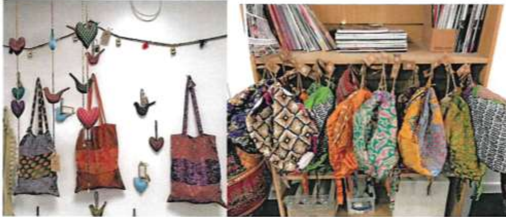
Bags and hangings made for Namaste in India from recycled silk saris