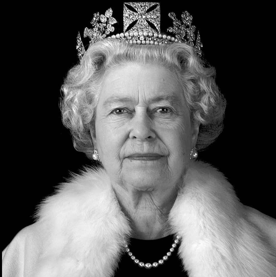
HM Queen Elizabeth II 1926 - 2022

School will be closed as a mark of respect on Monday 19 September 2022 for the state funeral of HM Queen Elizabeth II in line with Government legislation