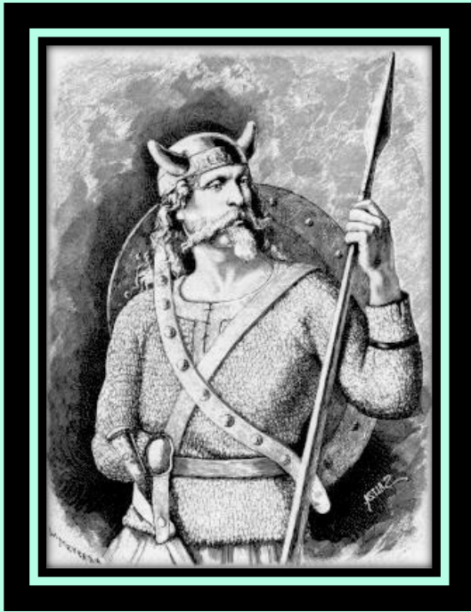
God of battle - Tiw