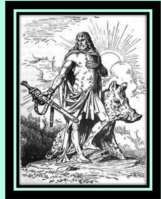
God of rain and crops - Frey