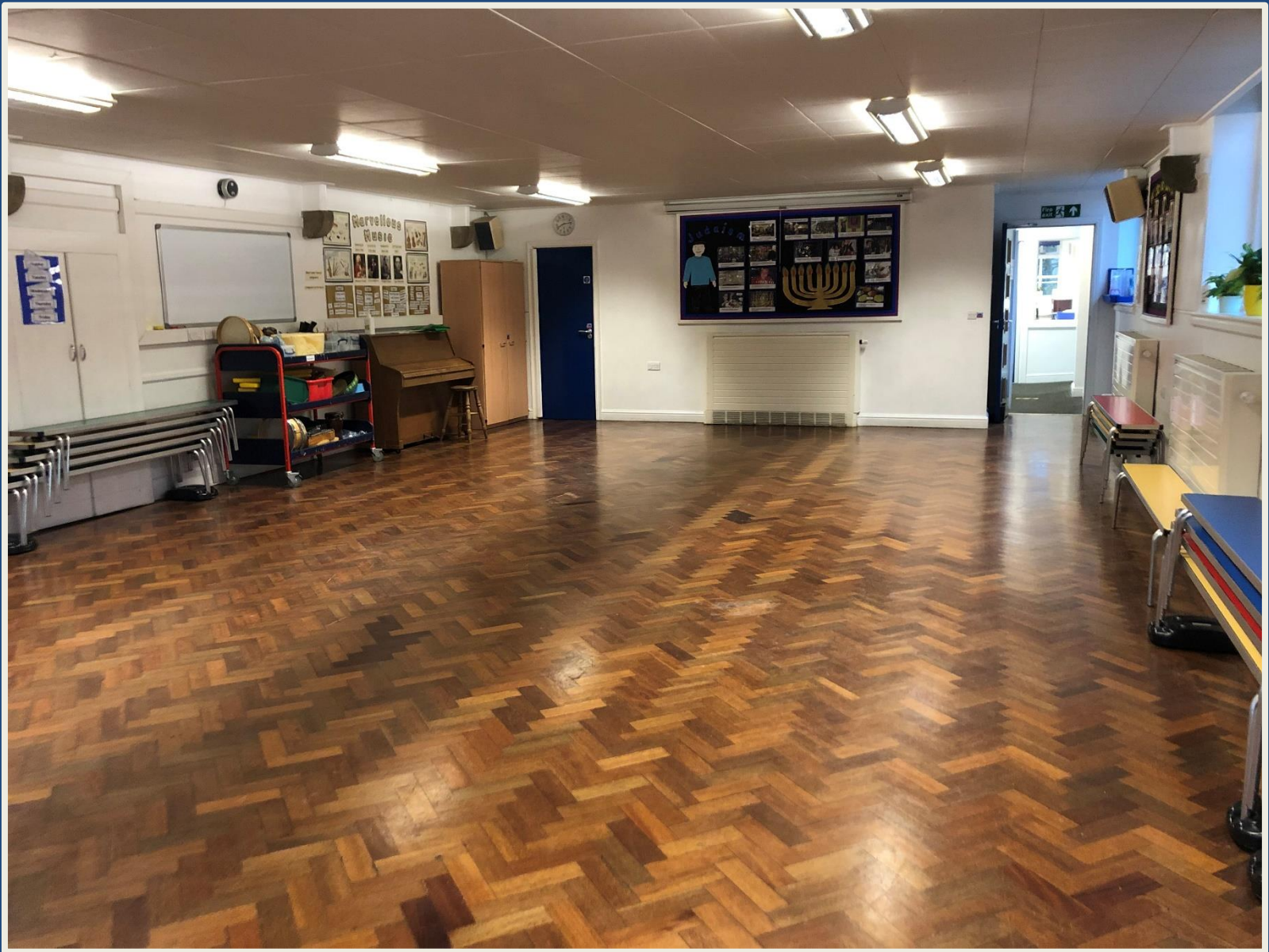
This is our school hall where we have assemblies, music lessons, P.E. lessons and our lunch