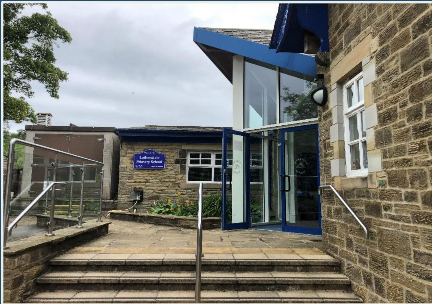
This is the main school entrance